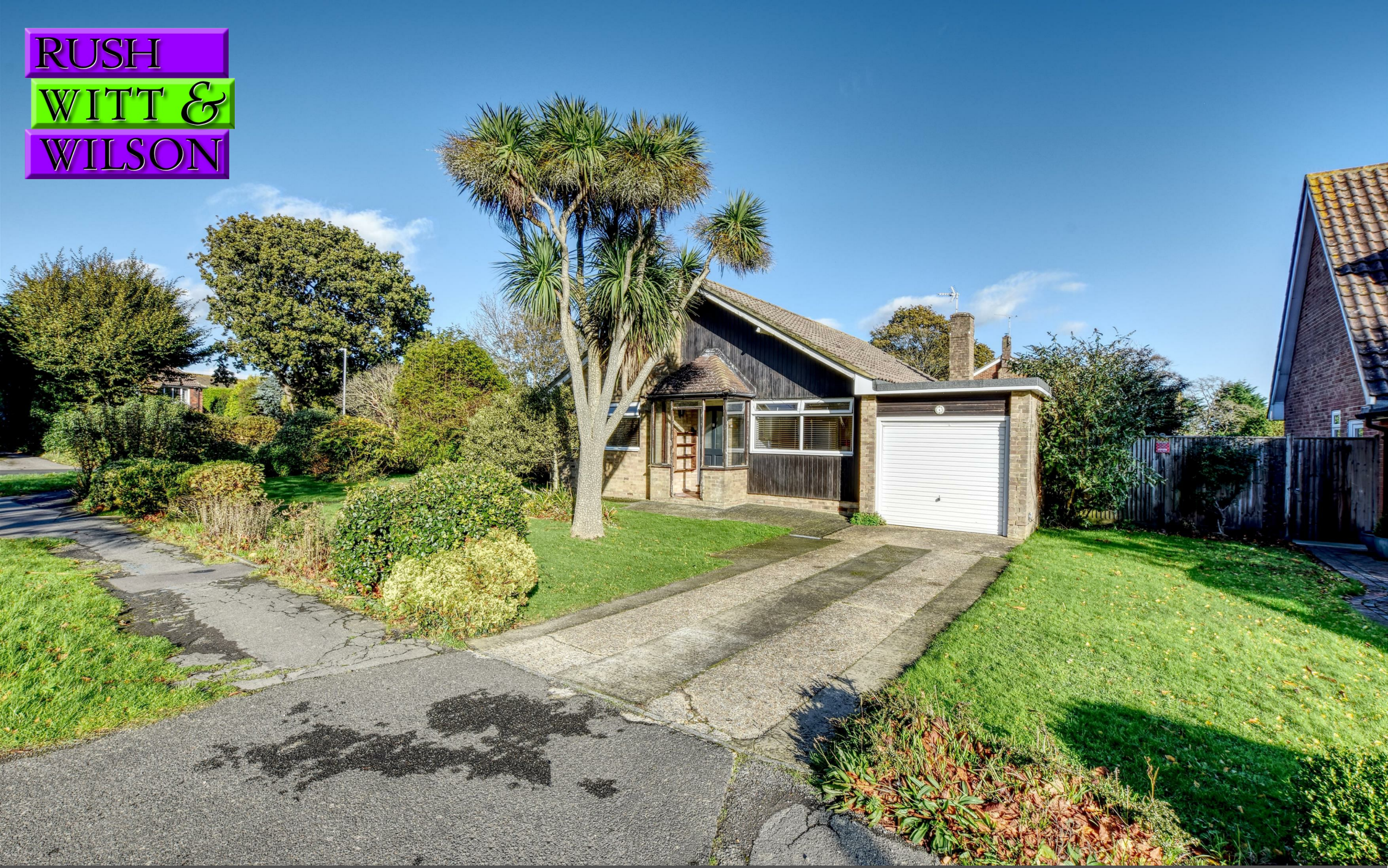
1 Crofton Park Avenue, Bexhill-On-Sea, East Sussex TN39 3SE £495,000